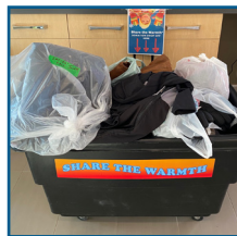
Collection bin at the credit union

We partner with the Biggar & District Family Centre on our annual Share the Warmth campaign. Donations of gently used, warm winter clothing are collected at our three branches. The donations are shared free of charge. All donations come from and stay in our community. Donors are entered in a draw to win a $100 gift certificate at local food stores. Donations were shared on November 8 th at the Family Centre.