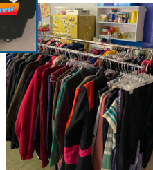
Racks of clothes at the Family Centre