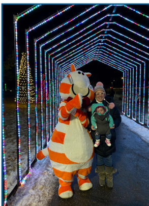
FATCAT with a young fan at the Festival of Lights