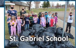
St. Gabriel School