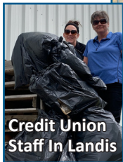
Credit Union Staff In Landis