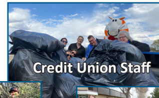
Credit Union Staff