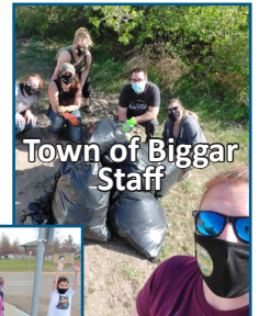
Town of Biggar Staff