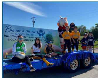
Fat Cat and the crew on our float for Town & Country Fair Days in Biggar.

We believe in leading the way in supporting local non-profit and charitable organizations. Just one more way we are building better communities.